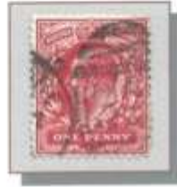
1902 - 1d Red

also known as Typographed or Letterpress Printing