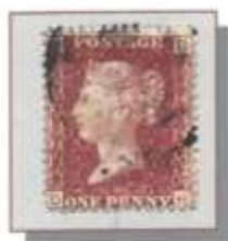
1858 - 1d Red

The early British stamps are considered the Classics of all the worlds first Postage Stamps, and rightly so. They set the design and production standard by which all of the early Commonwealth Issues were to appear. The Penny Black remains The Definitive Engraved Issue, with the exquisite Engine Turned background to the bust of the very regal young Queen Victoria, a simple but truly remarkable First Adhesive Postage Stamp.